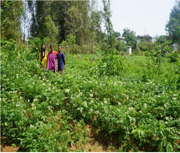
Photo - Potato cultivation in farmer's field