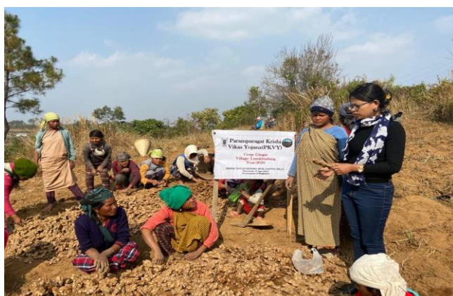
Photo - Field day of Ginger