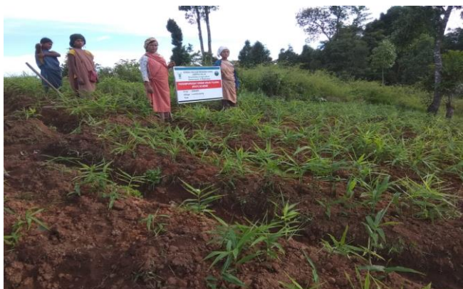
Photo - Ginger cultivation under PKVY

Being a farm women, she has developed linkages with other Departments/organizations such as the State Horticulture Office, ATMA, Sericulture Department and soil department thus enabling her to obtain various schemes, benefits and aids, not only for her particular self but for her fellow farm women belonging to her village organization.