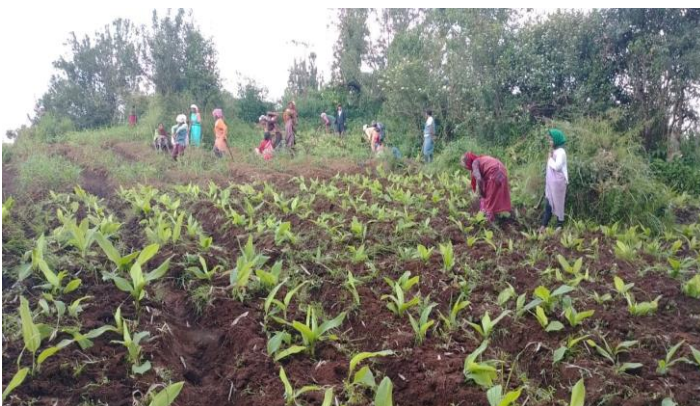
Photo - Turmeric cultivation under PKVY