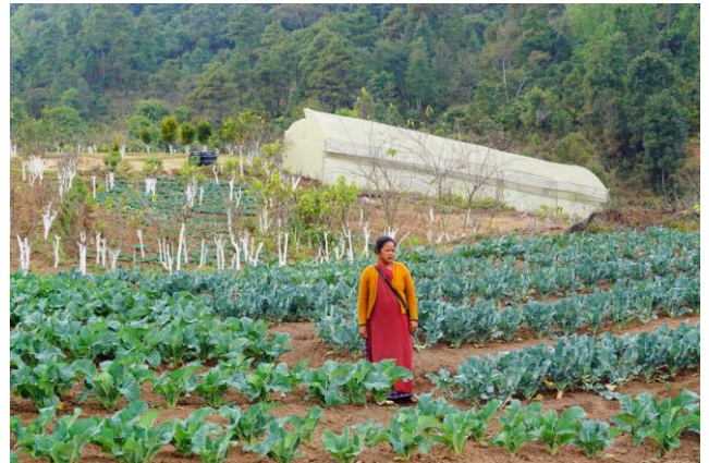
Cultivation of cole crops