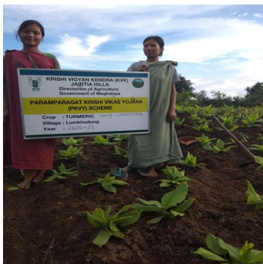
Photo - Turmeric cultivation