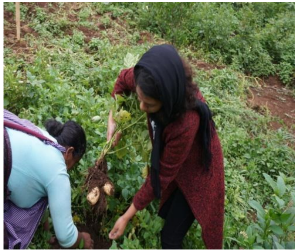
Photo - Harvesting of potato