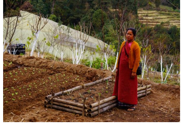
Raised bed for nursery raising of vegetables