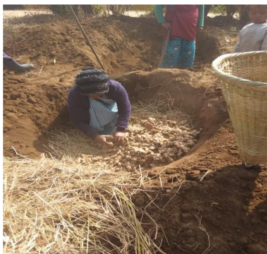
Photo - Storage of Ginger