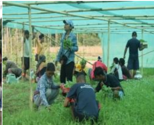
Certified seeds; Land Preparation; Establishment of Community Nursery and Seedlings distribution to farmers