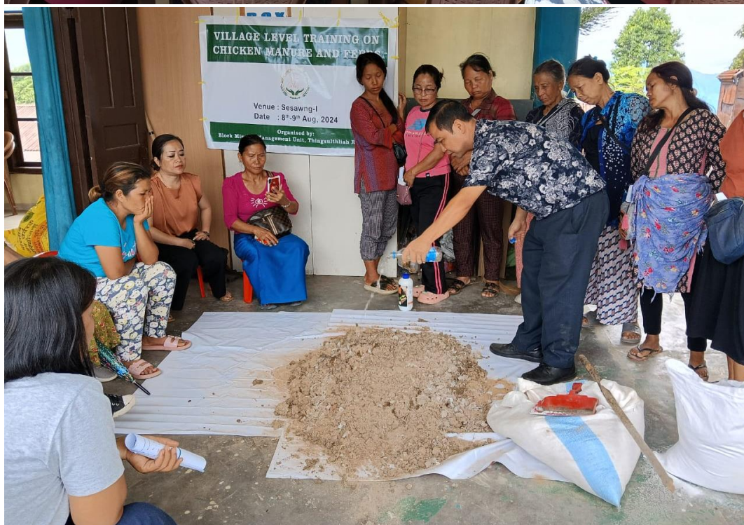
Village Level Training on Chicken Manure and Feeds jointly organised by KVK & Block Mission Management, MZSRLM, Thingsulthliah RD Block during 8 th – 9 th August, 2024 at Sesawng.