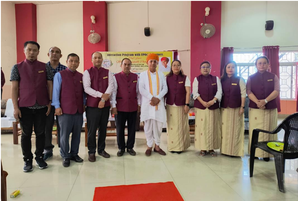
Krishi Vigyan Kendra, Aizawl organized Exhibition during the visit of Hon'ble Minister of State for Agriculture & Farmers' Welfare, Govt. of India, Shri. Bhagirath Choudhary on 18 th July, 2024 which was attended by invited 50 farmers within Aizawl district.