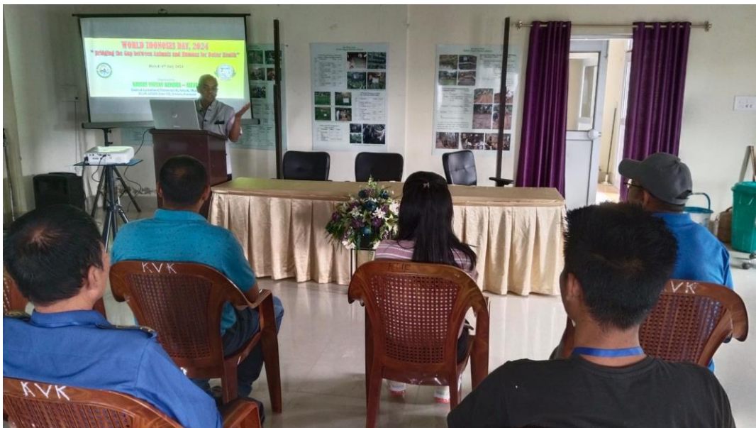
World Zoonoses Day was celebrated on 7 th July, 2024 at Conference Hall, KVK. Invited farmers were aware about the prevailing zoonotic diseases through power point presentation.