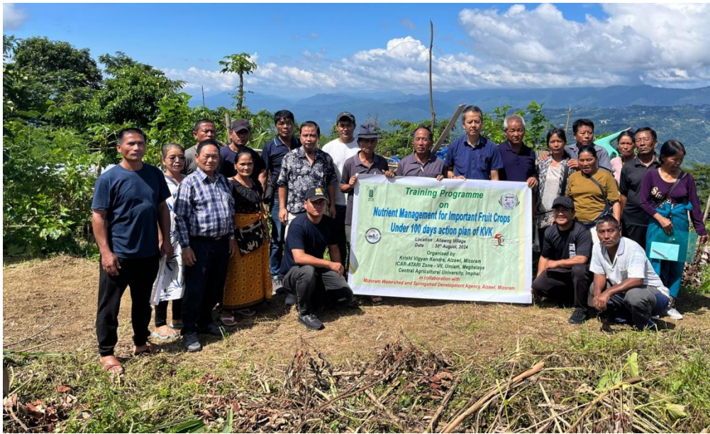
Training on Nutrient Management for important fruit crops under 100 days action plan of KVK was conducted on 30 th August, 2024 at Ailawng Village.