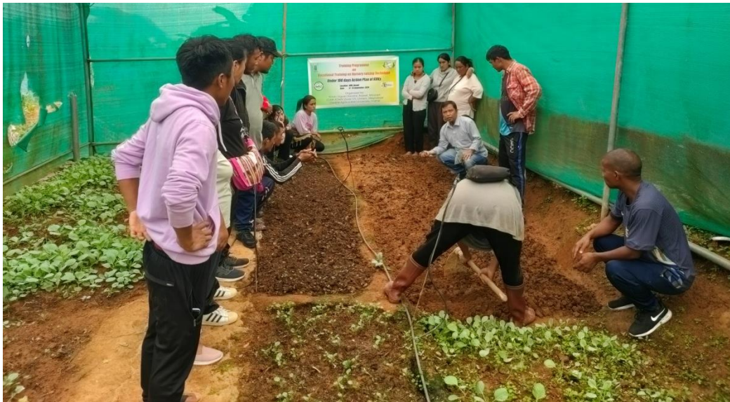
Training on Nursery Raising techniques was organized on 10 th September, 2024 under 100 days programme