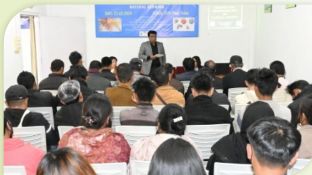
Conducted training cum demonstration programme under out-scaling of Natural Farming through KVKs on 23rd March 2024 at KVK Phek, Porba.