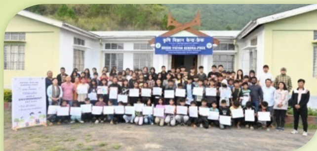
Celebrated world environment day on 5th June 2024, with the students from GHC, Porba.