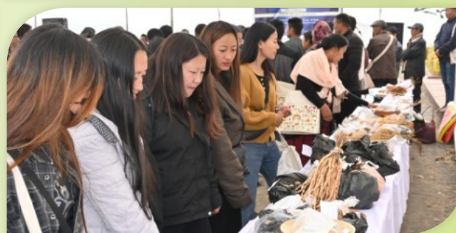
Plant Genetic Resources Conservation and Biodiversity Fair on 19th of February 2024