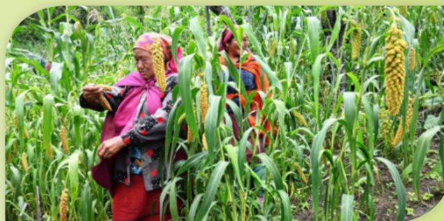
Field day on foxtail millet