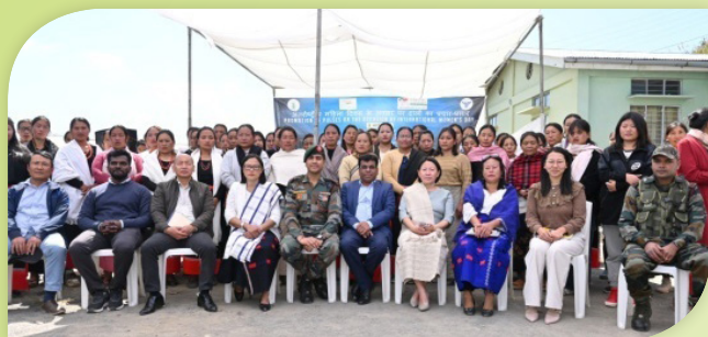
Celebrated International Womens Day in collaboration with ICAR-IIPR, Kanpur, to Promotion of Pulses at KVK Phek, Porba, on 8th March, 2024.