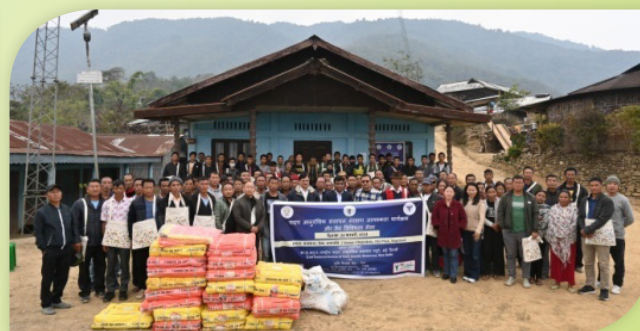
Plant Genetic Resources Conservation and Biodiversity Fair” on February 20, 2024 at Chepoketa, Phek