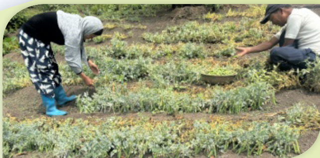
Field day on field pea