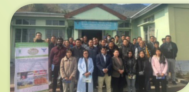
Conducted one day HRD programme on Biodiversity Conservation and Farmers Right's on 16th February 2024