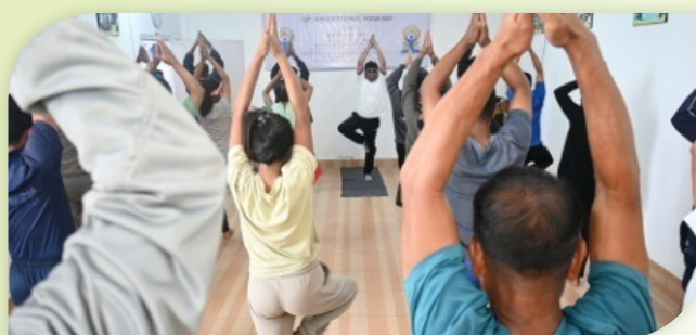
10th International Yoga Day Celebrated