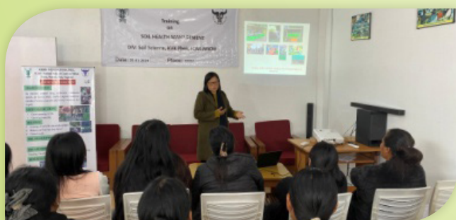
On campus training on Soil Health management