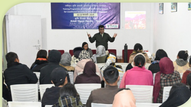
Conducted two-day training program, “Integrated Farming System for Livelihood Security of Farmers in Nagaland In total, 60 farmers from 5 villages attended this programme.