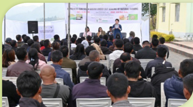
Awareness cum Kisan Gosthi under out-scaling of Natural Farming through KVKs on 26th March 2024 at KVK Phek,