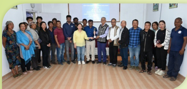
KVK Golden Jubilee Torch Prayan on May 22, 2024