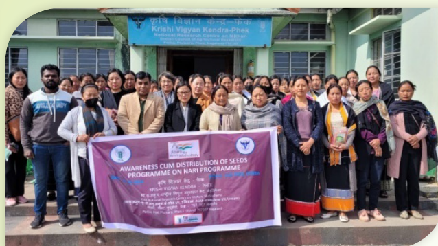
One day awareness cum seed distribution programme under Nutri-sensitive Agricultural Resources and Innovation (NARI) was conducted at KVK Phek, Porba, on February 15, 2024.