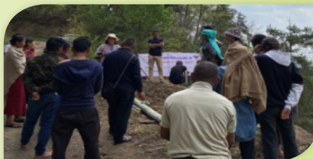
Method demonstration on foxtail millet