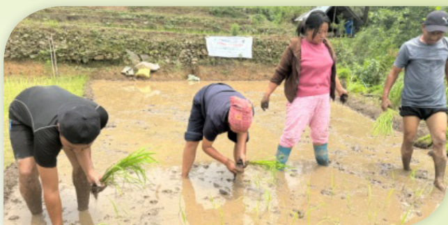
Method demonstration on integrated crop management