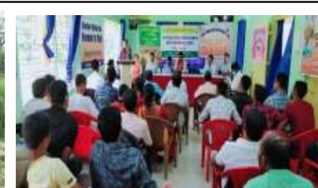
DDA & KVK (Dhalai)