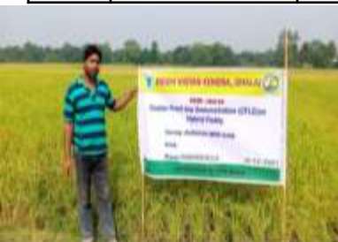
CFLD Hybrid Paddy