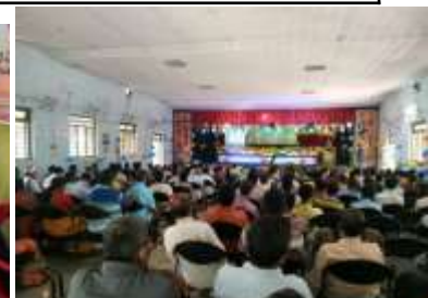
CAT & KVK