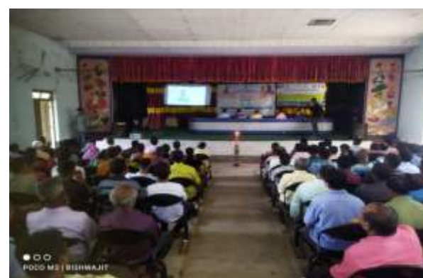
Celebrating "International Year of Millets-2023"