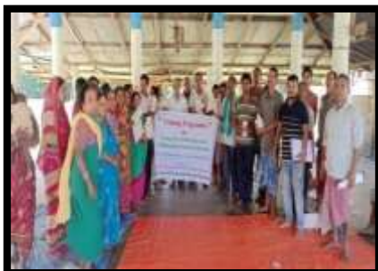
Training on Crop Diversification for Enhancing Farmers Income