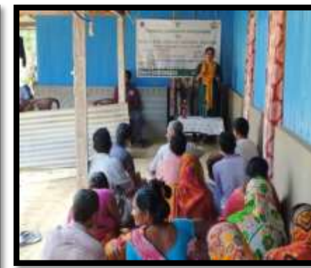
DAMU Extn. Activities