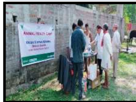
Animal Health Camp