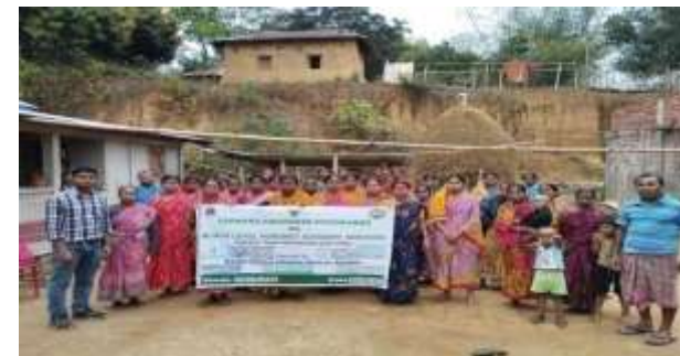
Farmers Awareness Programme on Block Level Agromet Advisory Services, District Agro Metrology Unit (IMD) organized by KVK Dhalai