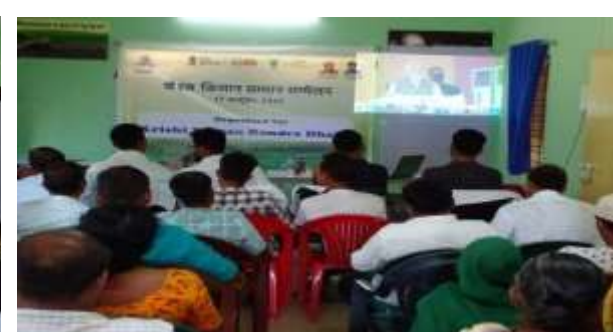
Live telecast Programme arranged by KVK Dhalai regarding "Hon'ble Prime Minister Shri Narendra Modi released 12th Instalment under PM-KISAN scheme."