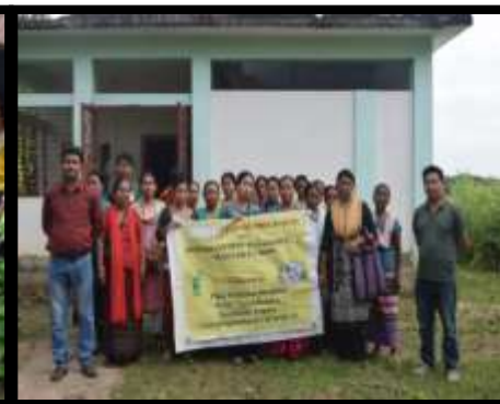
Kisan Gosti & Awareness Programme