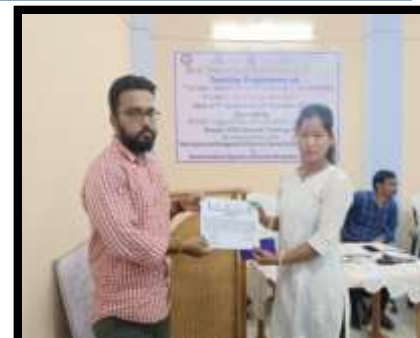
Training programme on Value addition