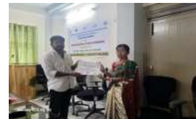
3 days collaborative training programme under TSP Scheme with ICAR-CIFE, Mumbai on “INTEGRATED FISH FARMING”