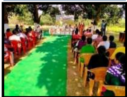
Farmers Scientist Interaction Prog