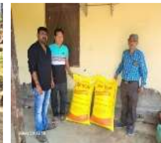
DUCK CUM FISH IFF Collaborative programme under TSP scheme with ICAR-CIFE Mumbai