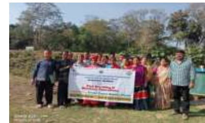
3 days collaborative training programme under TSP Scheme with ICAR-CIFE, Mumbai on “FISH BREEDING AND HATCHERY OPERATIONS”