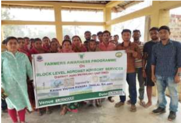
Farmers Awareness Programme On Block Level Agromet Advisory Services