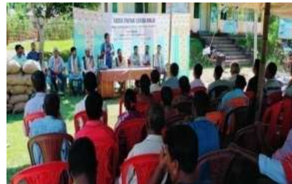
"Mega Distribution of potato seeds cum interaction programme"