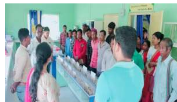
One day lead farmers exposure visit of Dhalai Organic Farmers Producer Company LTD. under mission organic value chain development for North-Eastern Region, Phase-II, with the support of KVK Dhalai.