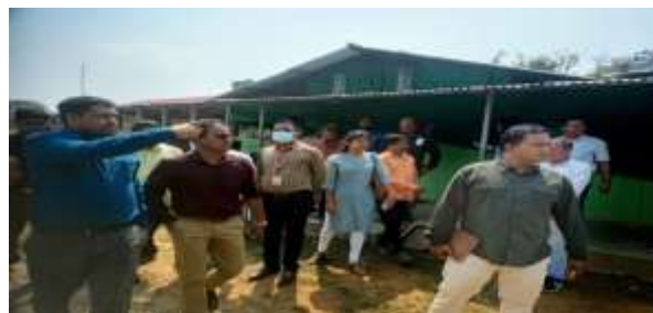
DM and Collector and different departmental official visited KVK Dhalai