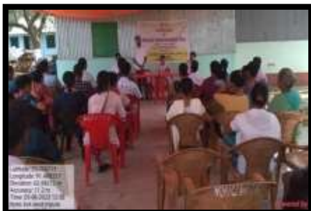
Celebration of World Environment Day