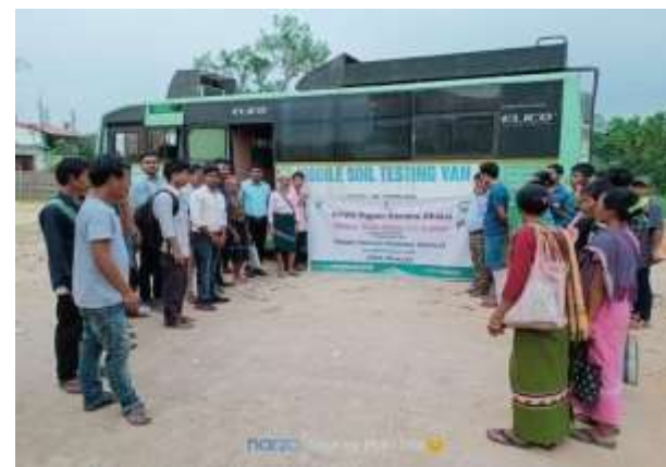
"Mega Soil Health Camp" at different places organized by KVK Dhalai