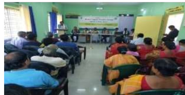
Training and survey programme on Pigeonpea cultivation