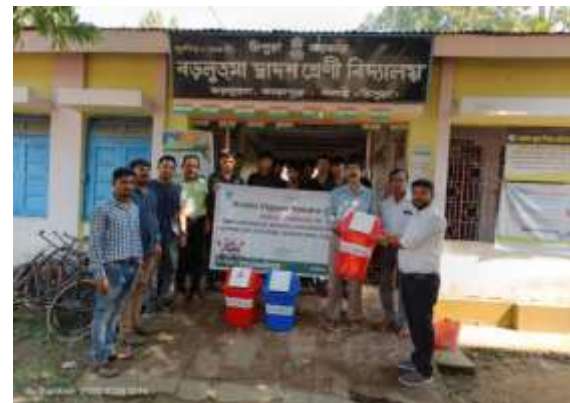
Special Campaign 2.0 on Swachhata at different places by KVK Dhalai