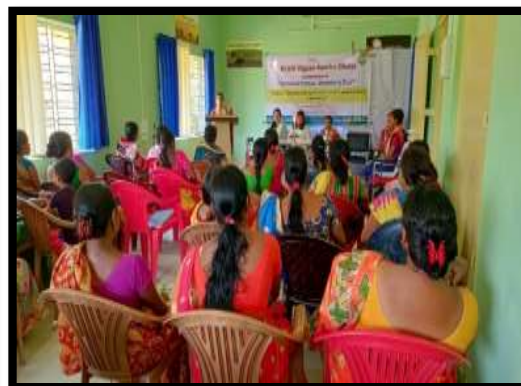
International Women's Day