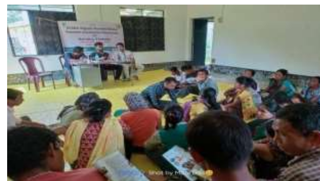
Some Training programmes on Natural Farming at different places