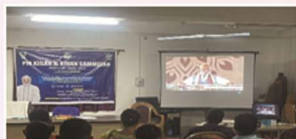
Fig 13: PM KISAN Samman Nidhi Programme(18th June)