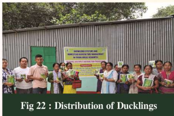
Fig 22 : Distribution of Ducklings