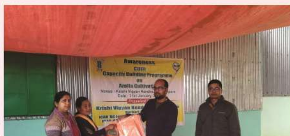
Fig 20: Distribution of Silpaulin Tarpauline Sheet