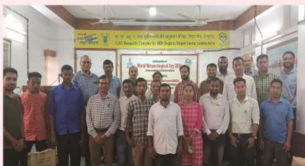
Fig 35 :World Meteorological Day celebration at ICAR Tripura Centre