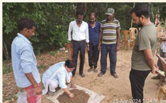
Fig 26 : Demonstrates Soil Sampling Method