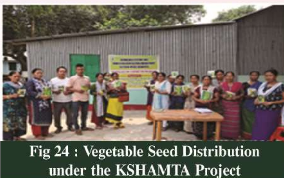
Fig 24 : Vegetable Seed Distribution under the KSHAMTA Project