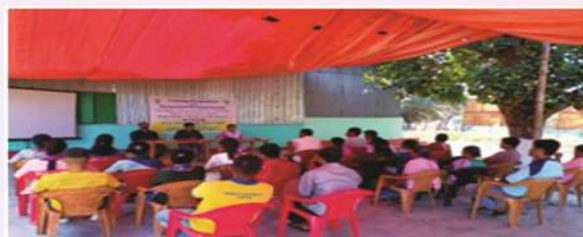
Fig 7: Training on Integrated Farming System

The training programme on Integrated Farming System (IFS) was organised from 5th March to 14th March 2024 at KVK West Tripura campus covering 30 nos of farmers and farm women across the district. This training programme aims to educate the farmers on Integration of agriculture with other components namely Fishery, poultry, duckery, piggery etc.