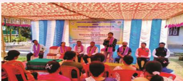
Fig 36 :Awareness Programme at Yuva Vikash Kendra