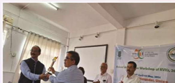
Fig 32: Annual Action Plan Workshop at ICAR ATARI Zone-VII, Umiam