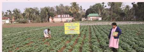
Fig 15 : OFT on Potato

These trials are aimed at identifying high-yielding crop varieties and improving market linkages to enhance farmers' income and sustainability. KVK West Tripura continues to focus on scientific interventions for strengthening the agriculture and allied sectors.