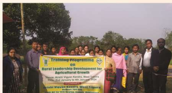
Fig 3: Training on Rural Leadership Development

From 2nd January to 4th January 2024, KVK conducted a Training on Rural Leadership Development for Agricultural Growth. This programme, attended by 20 farmers and farm women, focused on developing leadership skills to drive agricultural growth in rural areas.