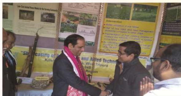
Fig 11.: Visit of ICAR DG and ICAR RC for NEH Region Director to the KVK West Tripura Exhibition stall