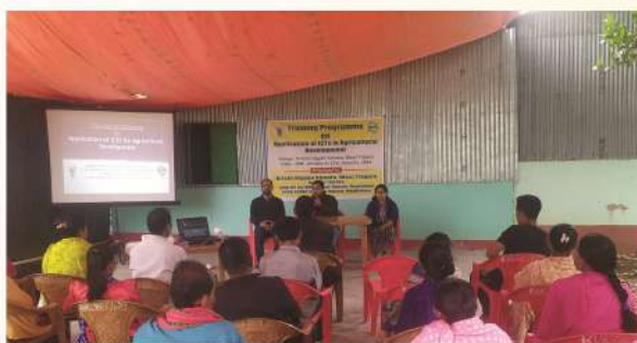
Fig 5: Training on Application of ICTs in Agricultural Development