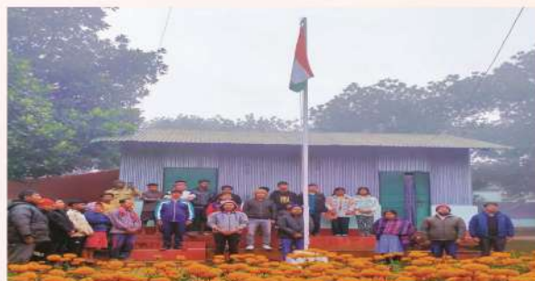
Fig 12: Celebration of the 75th Republic Day