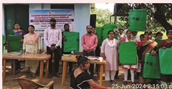
Fig 9: Training on vermicomposting

Three days training Programme on vermicompost production was conducted at KVK West Tripura from 25th June to 27th June 2024 for the parents of disabled children.