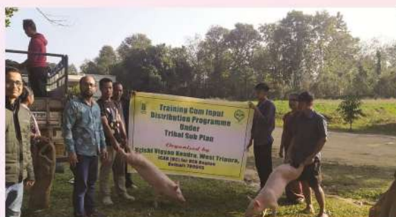
Fig 21 : Distribution of Piglets