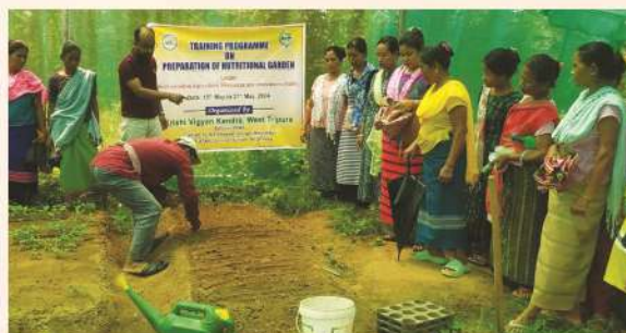
Fig 8: Training program on Nutritional Garden Development and Homestead Farming

A training program on Nutritional Garden Development and Homestead Farming was organized under the NARI Project at KVK West Tripura, Belbari, West Tripura, from May 15 to 21, 2024.