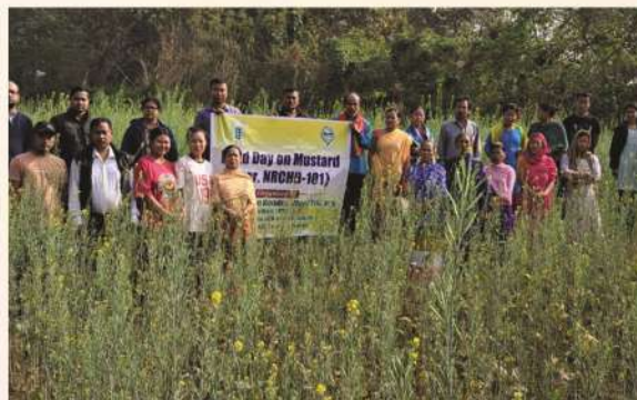
Fig 19: Field Day on Mustard

On 7th February 2024, KVK held a Field Day to showcase the performance of the Mustard variety NRCHB101.