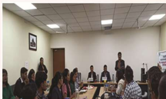
Fig 30: Training programme on "Rice cultivation in hill ecosystem" at ICAR-NRRI Cuttack