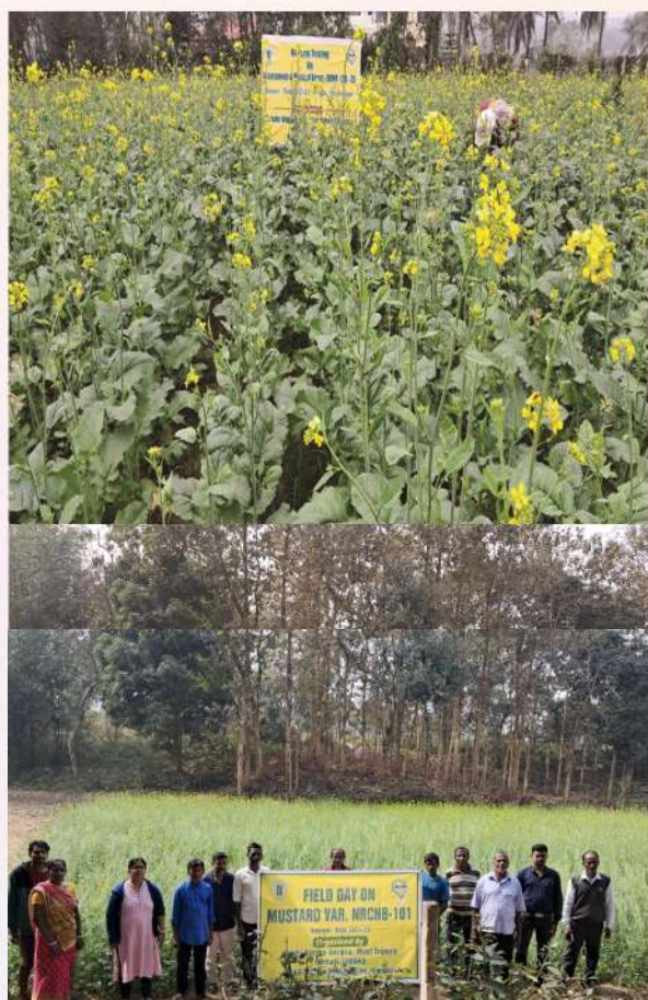
Fig 18 : CFLD on mustard var. NRCHB-101