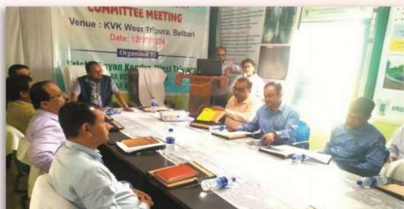
Fig.1: SAC members attending the meeting at KVK, West Tripura