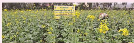
Fig 16 : OFT on mustard