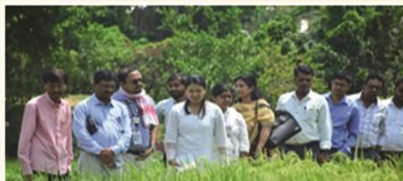
Fig 33 : Field visit with QRT ICAR Tripura Center