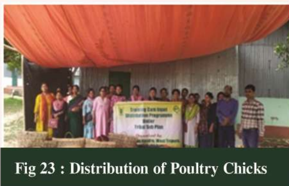
Fig 23 : Distribution of Poultry Chicks