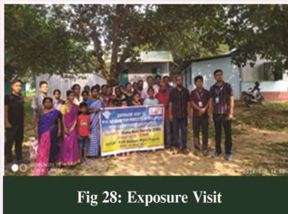
Fig 28: Exposure Visit

Exposure visit of the farmers and farm women from Oisho Bani Society on 9th May, 2024