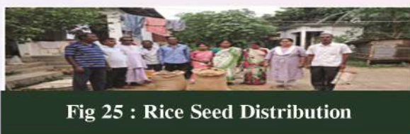
Fig 25 : Rice Seed Distribution