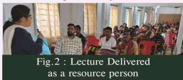
Fig.2 : Lecture Delivered as a resource person

KVK, West Tripura : Capacity Building through Training Programmes. Krishi Vigyan Kendra (KVK), West Tripura, has been at the forefront of empowering farmers, rural youth, and extension personnel through a series of skill development training programmes. These initiatives are aimed at enhancing agricultural productivity, improving management skills, and introducing modern farming practices to the local farming community.