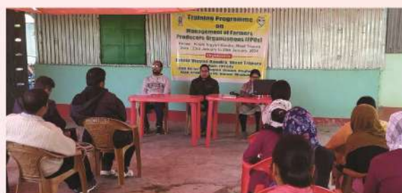
Fig 4: Training on Management of Farmer Producer Organizations (FPOs)