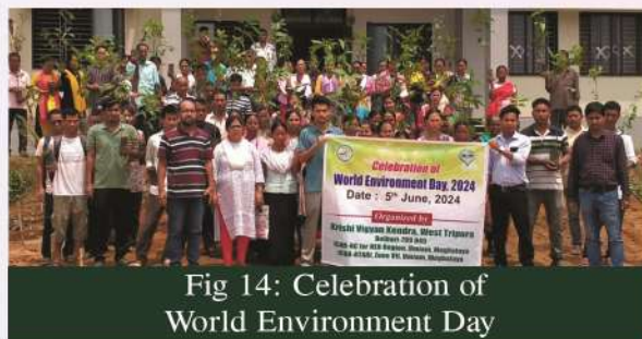
Fig 14: Celebration of World Environment Day