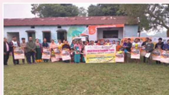
Fig 10.: Viksit Bharat Sankalp Yatra