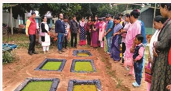
Fig 6: Awareness Cum Capacity Building Programme on Azolla Cultivation

On 31st January 2024, KVK organized an a Capacity Building Programme on Azolla Cultivation. With 48 participants, this training focused on the benefits of Azolla as a bio-fertilizer and animal feed, improving soil health and enhancing crop productivity..