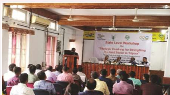
Fig 31: Workshop programme on Strategic roadmap for strengthening the seed sector in Tripura