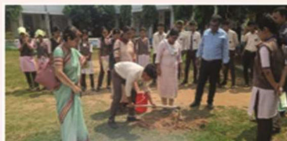
Fig 27: School soil health card programme

Exposure visit of the farmers and farm women from Oisho Bani Society on 9th May, 2024