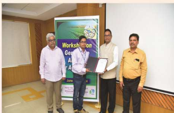
Fig 34 : Ai workshop at ICAR NAARM