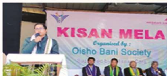
Fig 29 : Kisan Mela